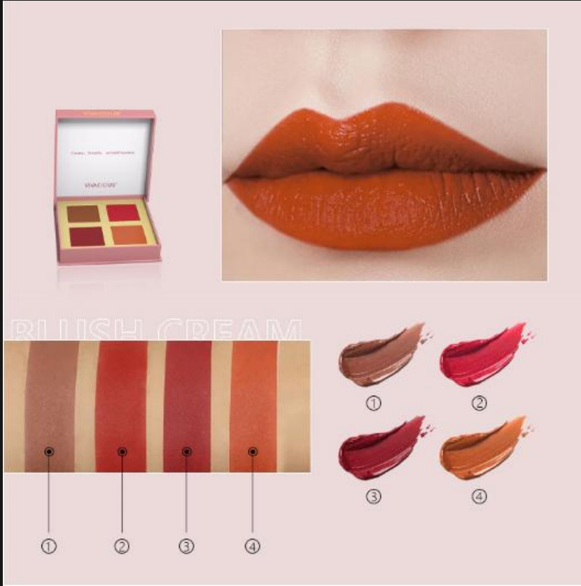
Blush Palette (VITALITY)

【Multi-purpose Makeup Palette】 4 carefully selected colors, each color can be used individually or mixed to create more colors. It can be used to modify the whole face when necessary, convenient to refine the makeup when you are outside. It can not only be use as blush, but also as eyeshadow, highlighter, lipstick to modify the whole face.