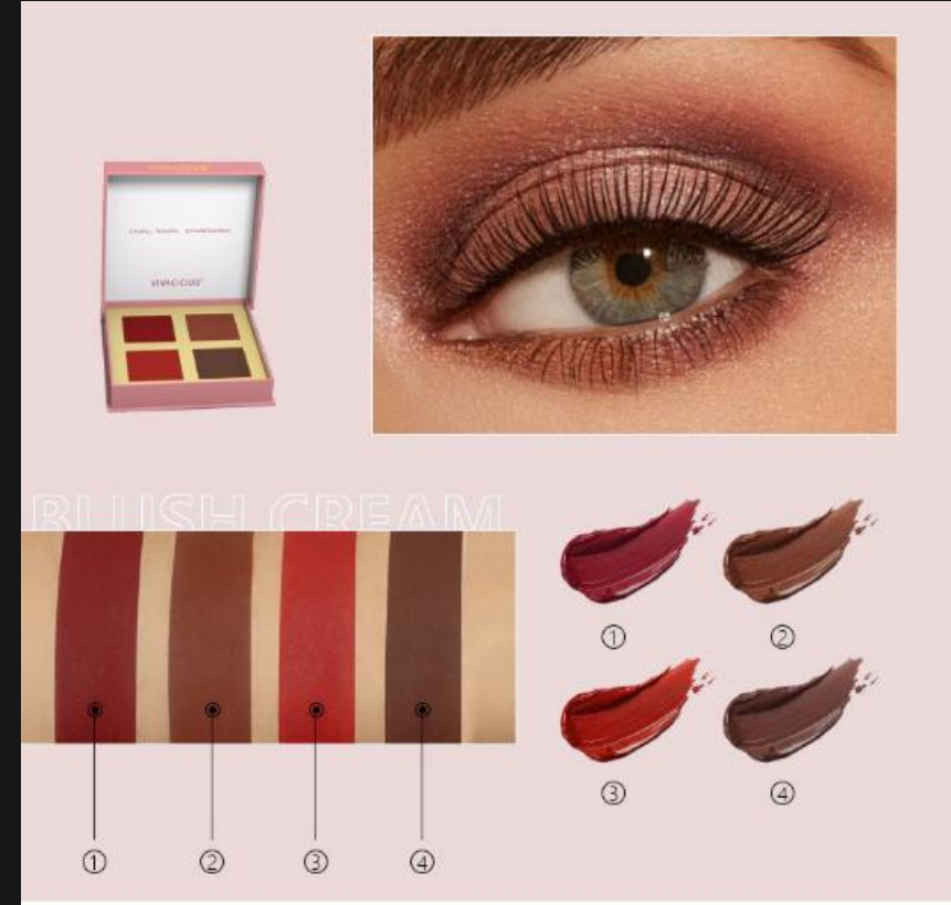
Blush Palette (SPICY)

【Natural look】 Ultra silky smooth and anti shine texture of this blush cream provides a pigmented matte natural finish. It blends out very well and lasts all day.