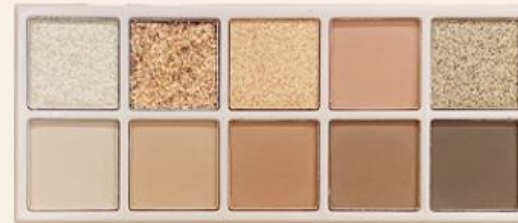
Lazy Spring Day